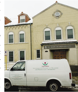
The Dental HouseCall unit in New Jersey serving patients.

Several dentists also participate in the Dental HouseCall project. Equipment is transported to private residences, long-term care facilities, inner city schools, and mental health centers. Individuals unable to go to dental offices are provided comprehensive care at those sites. Approximately 3,900 individuals in New Jersey and metropolitan Chicago were assisted with $720,000 in treatment. Twenty-three percent (23%) was contributed.